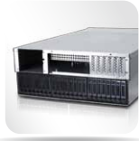
Rear Access 24 x 2.5" HDD