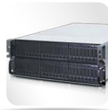
Front Access 48 x 2.5" HDD