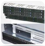
Front and rear accessible modular HDD cage