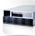
Rear Access 12 x 3.5" HDD