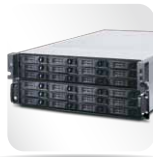
Front Access 24 x 3.5" HDD