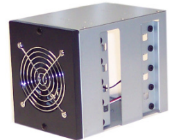
YY-W2xx Cage (Optional)